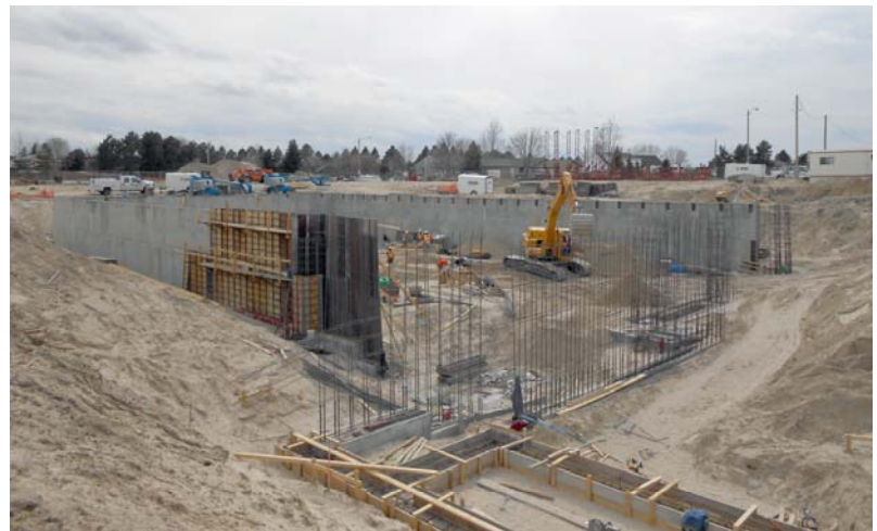
2014 Jobsite progress: Upper left, January 28; Upper Right, April 10; Left, September 28; Below, September 30