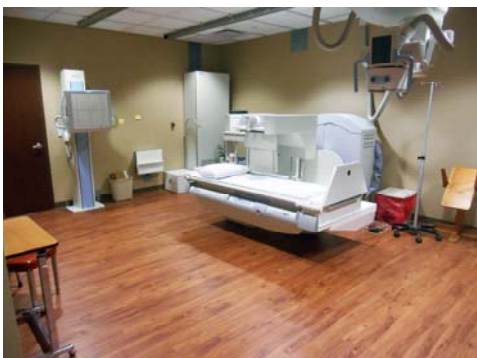
Left: New X-Ray Dept., Center: New private patient room, Right: New Front Lobby

This summer, the hospital sold pink shirts to honor a fellow staff member and in recognition for Relay for Life. Our employees on site got involved and even participated in their pink ribbon photo. A big thank you to the guys in the field for supporting the communities they work in.